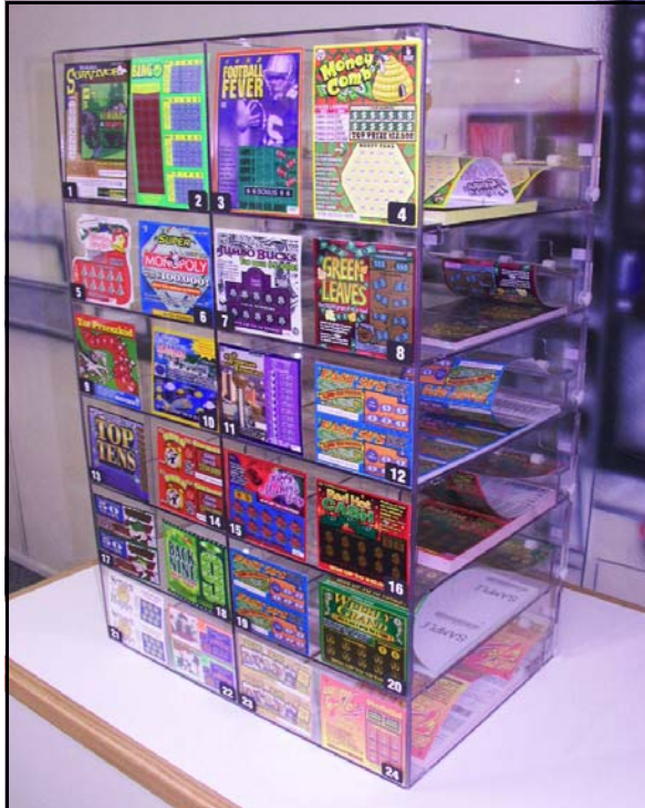
OCSC-24 with 6" bins on top