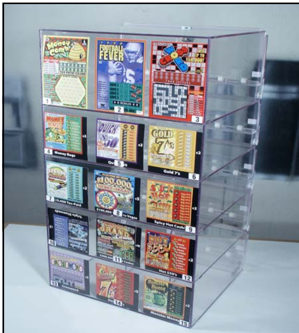
OCSC-15 with 6" bins