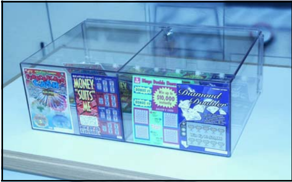
OCSC-4 game "Topper"