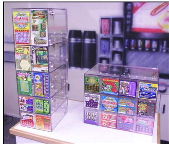
OCSC-10 with 6" and 8" bins OCSC-12 short version

TAKE-A-TICKET, Inc. 800.253.4295 fax: 541.967.8415 info@tatinc.com