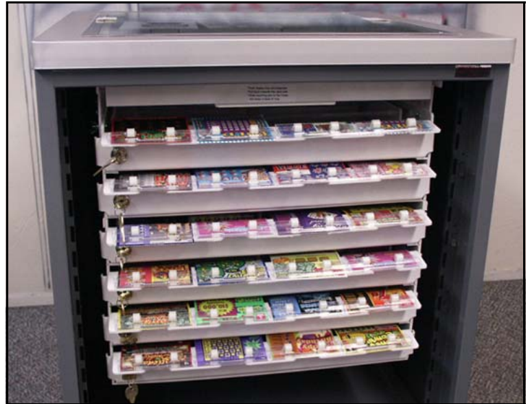
View from the clerk side